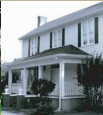
THE BUSH HOMEPLACE NATIONAL REGISTER NOMINATION, 2003