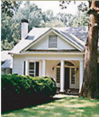
THE MCBEE SUMMER HOME HISTORIC MATERIALS ASSESSMENT AND NATIONAL REGISTER, 1997