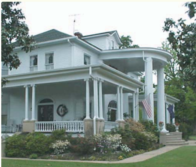
THE MCWHIRTER HOUSE NATIONAL REGISTER NOMINATION, 2002

History, from this perspective, isn't dusty or irrelevant. It's a valuable asset that informs preservation projects and a vital resource that makes a variety of real estate endeavors more attractive, more authentic and more rewarding.