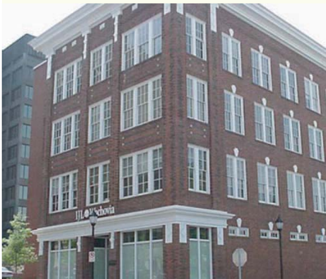
CAROLINA SUPPLY BUILDING

We've been partners. We've been guides. We've been collaborators. And we've helped clients turn the buildings and ideas of the past into valuable assets for the present and future.