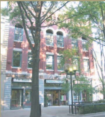
STRADLEY & BARR DRY GOODS HISTORIC TAX CREDITS, 2004

Part passion, part practicality, our Three Sides of Preservation model assesses the physical, cultural and economic characteristics of every project we undertake. This three-part analysis is a comprehensive approach that considers every angle and every perspective. The result isn't just information—it's insight that provides a clear focus for each opportunity and a strategic foundation that keeps projects on target, on time and on budget.