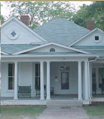
THE MORGAN HOUSE NATIONAL REGISTER NOMINATION, 2001