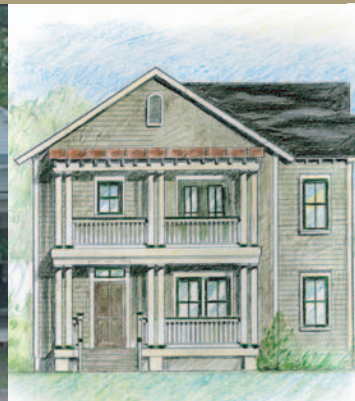
ROWLEY STREET RESIDENCE INFILL DEVELOPMENT, 2004