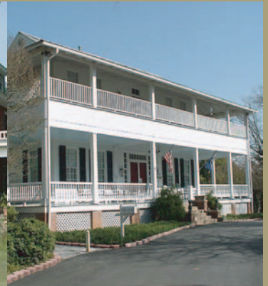
LIBERTY HALL NATIONAL REGISTER NOMINATION, 2001