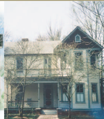
THE BAILEY HOUSE HISTORIC REHABILITATION, 1998